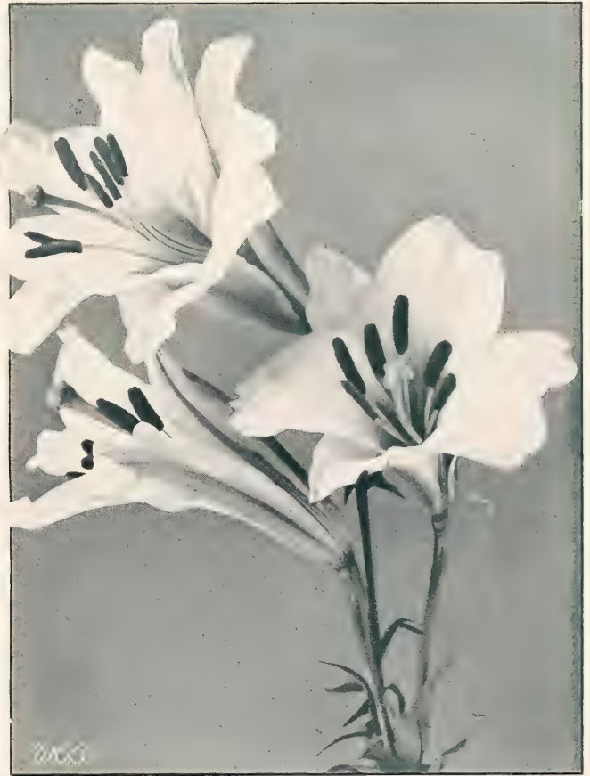
Lilium Regale, the Regal Lily